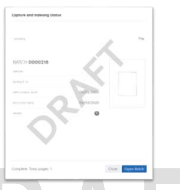
Figure 2.5.4.1 – Status Mockup