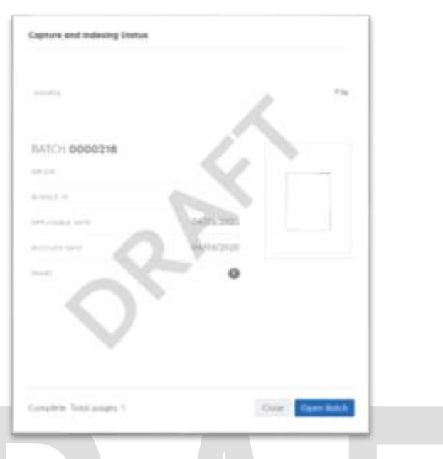
Figure 2.3.4.1 – Status Mockup