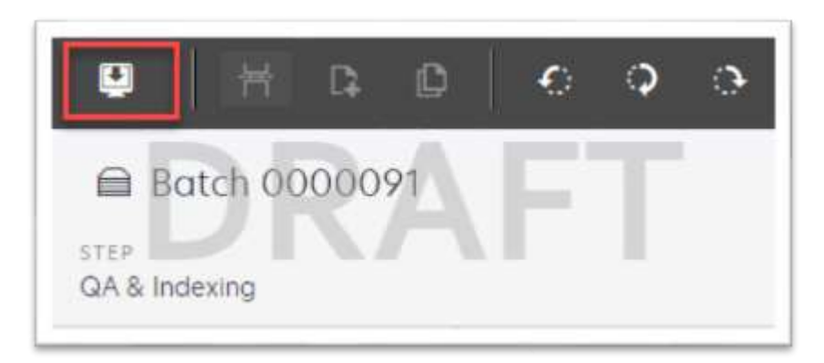
Figure 2.4.5.1 – Rescan/Capture Mockup