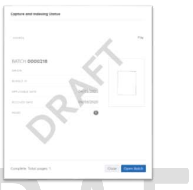
Figure 2.4.4.1 – Status Mockup