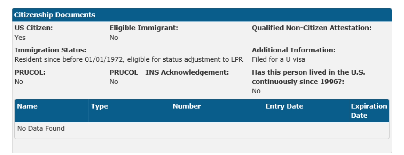
Figure 2.1.3- C-IV: Citizenship Documents Block