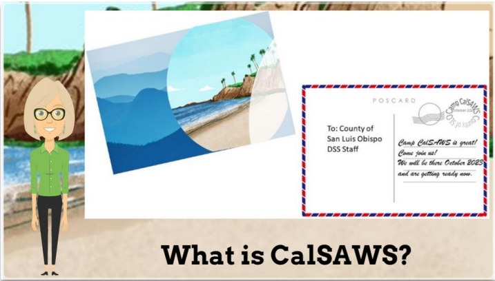
Virtual Roadshow Screenshot

We conducted a CalSAWS virtual roadshow that officially kicked off our efforts. This consisted of an introduction of our project team (all three of us) and a cartoon video showcasing several key characters providing information from their respective areas. To the chagrin of some, we do ice breakers at the beginning of meetings. These are meant to learn something, get to know each other or simply be fun. We also use various tools during remote meetings to conduct real time polls and activities. Additionally, we created a CalSAWS playlist that is used at the beginning of meetings. We identified two theme songs: Don't Stop Believin' by Journey and Happy by Pharrell Williams. We use them interchangeably based upon current mood.