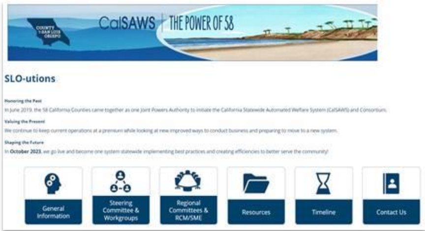
San Luis Obispo's Intranet Site

In an effort to not send staff to multiple locations to seek out information, we have an intranet site that is CalSAWS “one stop shopping”. It contains history, committee information, Sandbox and associated tools, videos, newsletters (both our internal and external), timelines, and a direct link to staff overseeing the project. In addition, “Let's Talk CalSAWS” are monthly topics provided to Supervisors to discuss at unit meetings so that intentional and consistent information is being shared.