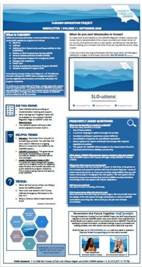
San Luis Obispo Newsletter