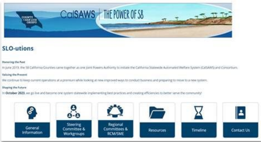
San Luis Obispo's Intranet Site

In an effort to not send staff to multiple locations to seek out information, we have an intranet site that is CalSAWS “one stop shopping”. It contains history, committee information, Sandbox and associated tools, videos, newsletters (both our internal and external), timelines, and a direct link to staff overseeing the project. In addition, “Let’s Talk CalSAWS” are monthly topics provided to Supervisors to discuss at unit meetings so that intentional and consistent information is being shared.