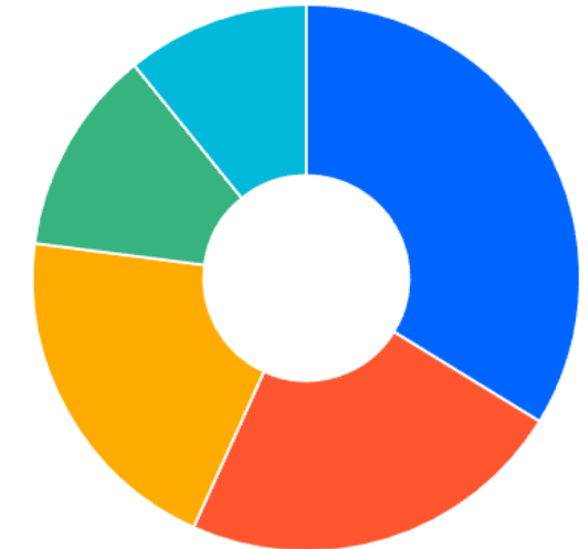
Implementation Readiness Category