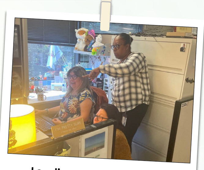
Lending a Helping Hand

I spend less time making appointments in CalSAWS than I did in CalWIN. So it's really helping me to be able to focus and I'm able to get more tasks done.