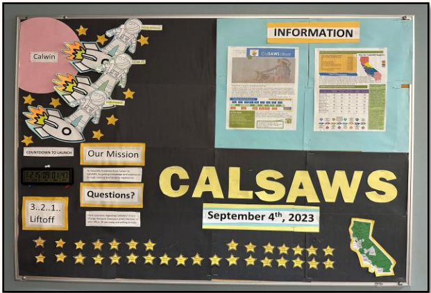
Alameda County bulletin board