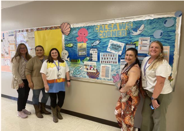
Sonoma County Change Network Champions!