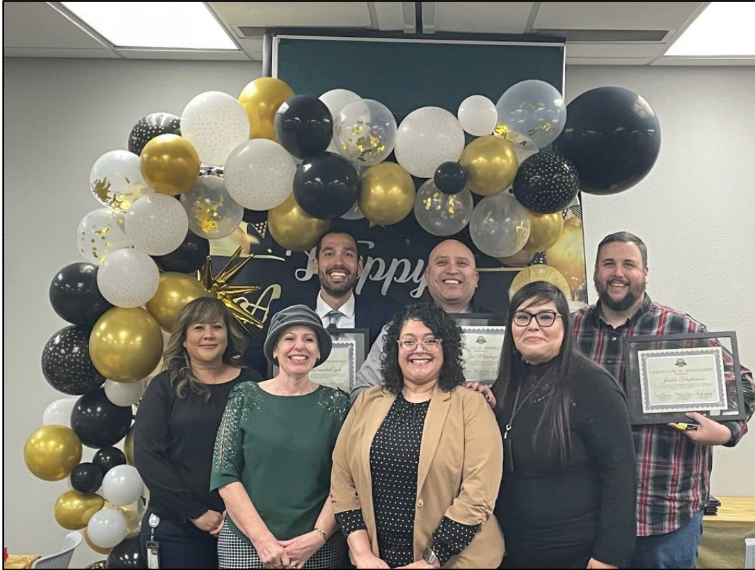
Tulare Celebration 2/27/24

The Region 4 Regional Managers from the CalWIN migration travelled to Tulare County on February 27 th to take part in a celebration acknowledging all of the hard work that had gone into Tulare's migration during wave 2. The 27 th was exactly one year after they had gone live, and the sentiment shared in the room was positive, appreciative and congratulatory. Tulare's leadership team took time to recognize the many staff and their specific contributions that helped make the migration a success. The RMs were honored to be recognized for their efforts during this ceremony as well and wanted to send a heartfelt thank you to Tulare County for inviting us. We always love meeting with our counties in person and it was nice to be able to take a step back from our day-to-day work, acknowledge this huge undertaking that we endeavored in, and acknowledge all of the wonderful people and things that come together to make that happen. Happy 1 year anniversary to Tulare and the rest of wave 2! 🐝