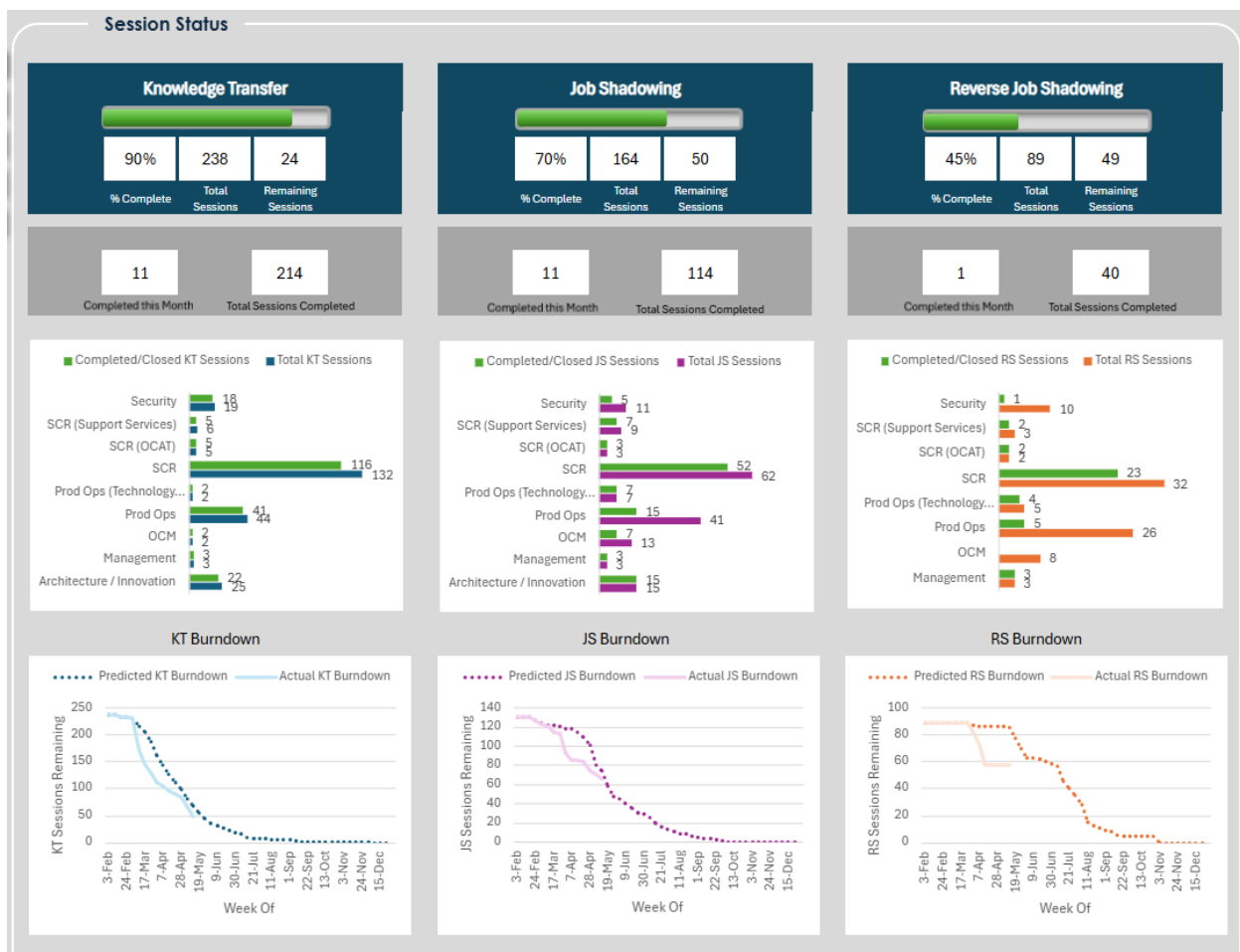
Figure 2: Knowledge Transfer/Job Shadowing/Reverse Shadowing Status