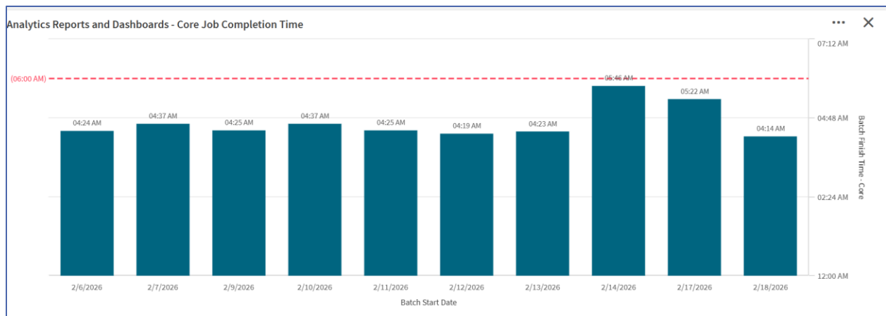
Figure 3: Analytics Reports and Dashboards – Core Job Completion Time and Late Count