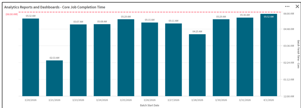
Figure 3: Analytics Reports and Dashboards – Core Job Completion Time and Late Count